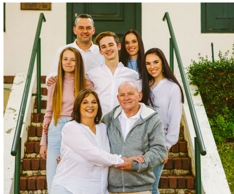
The three generations behind PAPAZ

At PAPAZ bistro, we've created a warm and welcoming atmosphere that's inspired by the involvement of three generations in this family business. The interior is a decorative mixture of the past, present, and future, carefully chosen to give you a unique experience.